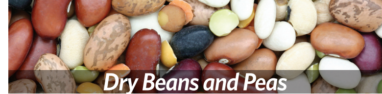
Dry Beans and Peas