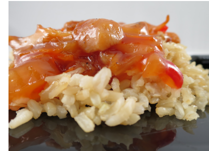
Sweet & Sour Chicken