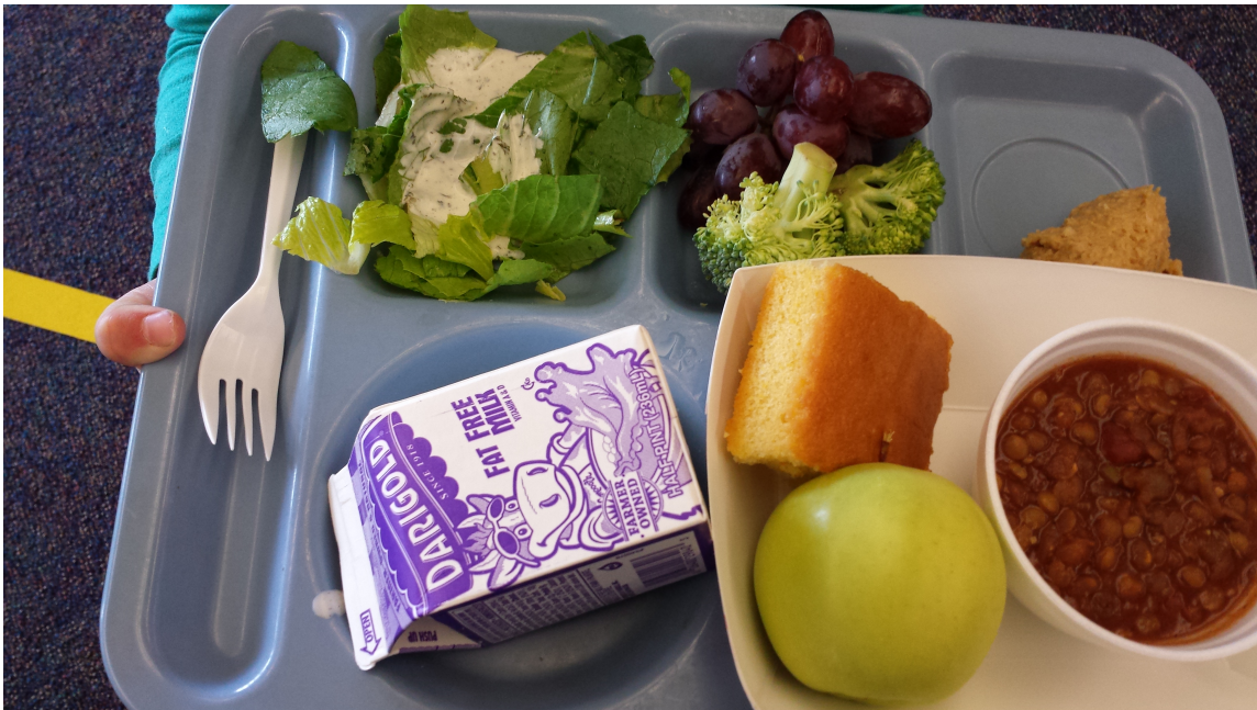
Palouse Chili, Freshly-Baked Cornbread & Salad Bar